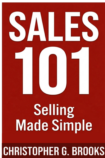
Selling Made Simple Sales 101, Book 1

Available through Ingram wholesale · 55% trade discount · Returnable · Print-on-demand via IngramSpark Contact: christopherb@tuor.ca · sales-101.ca